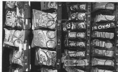
HEALTHIER CHOICES: Grain bars, nuts, baked chips and Frito-Newman are available in cafeteria vending machines

One Lubbock grade school, she adds, even rolled carts with candy down the halls to sell to kindergartners. "The whole culture invaded—by this marketing of food to the child. We put our financial needs ahead of their shocking."